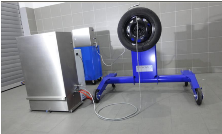
Tire Burst Testing Equipment (without safety housing)