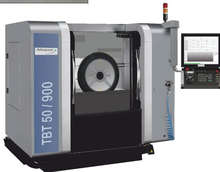
Tire Burst Testing Equipment with optional safety housing (example: TBT for 2-wheeler tires)