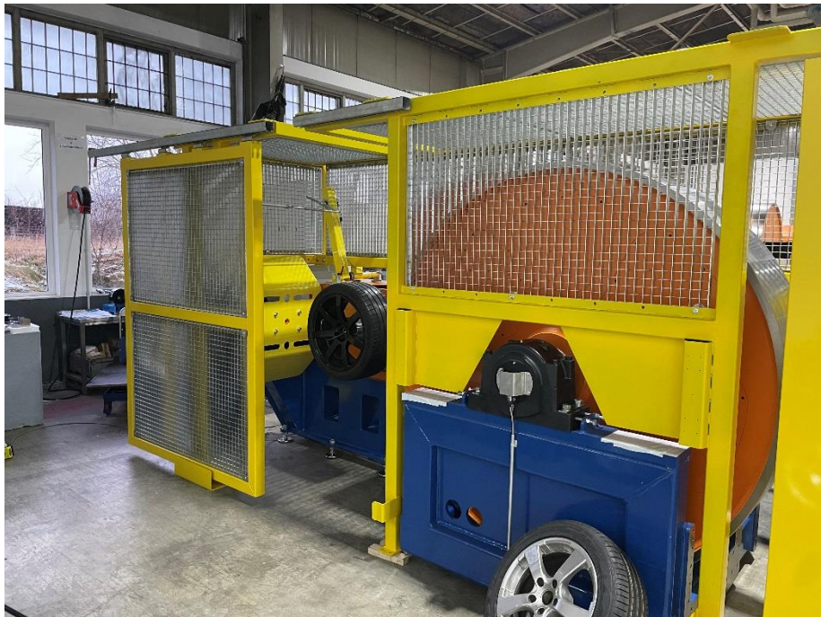
PCR RR test machine

Contact us to learn more about Altracon ● the solution provider